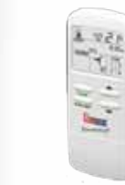
Remote control kit