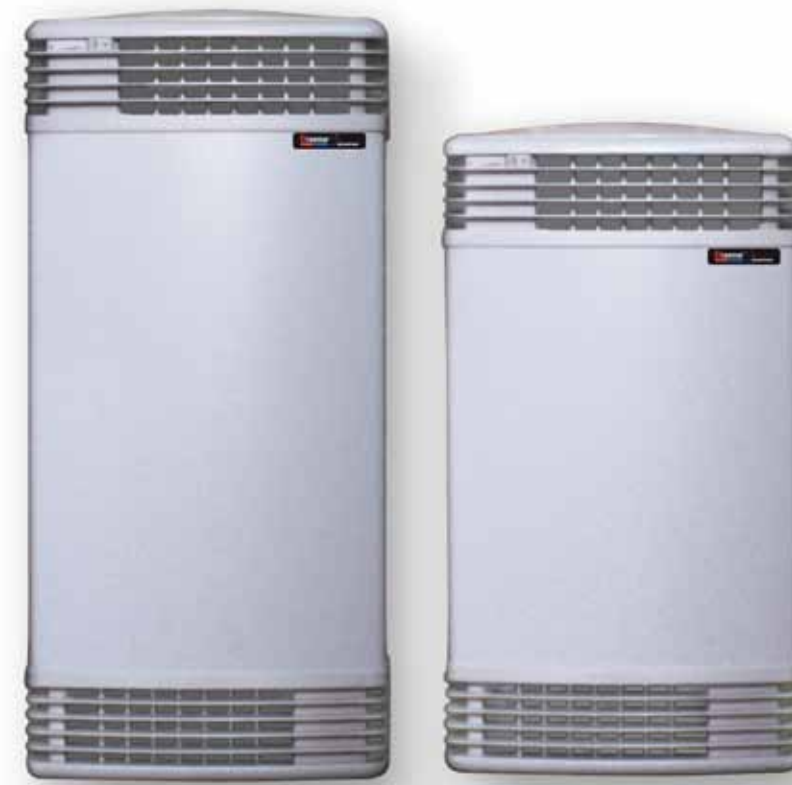
Braemar SH 25

Source: S.E.A.V. 2004 Annual Heating Cost Comparison.