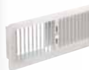
Rear register kit